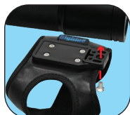
Fix the glove on the light with the supplied screw