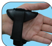
Tighten by pulling the velcro